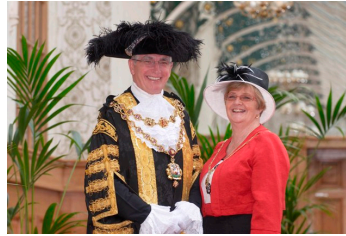
Lord Mayor and Lady Mayoress